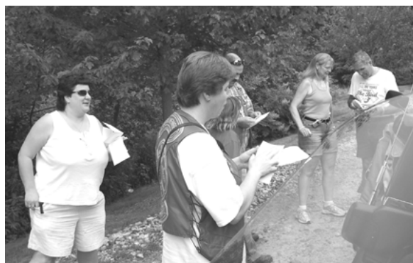
What are Swedish fish anyway??

Maple Leaf An orange Banana A daisy 2006 Dime Lady Bug Red Socks Marble Business card Black-eyed susan Push pin Swedish fish Massachusetts Quarter Floppy discs A dark chocolate truffle 2006 penny Acorn Paper clips Apple Magnet White out