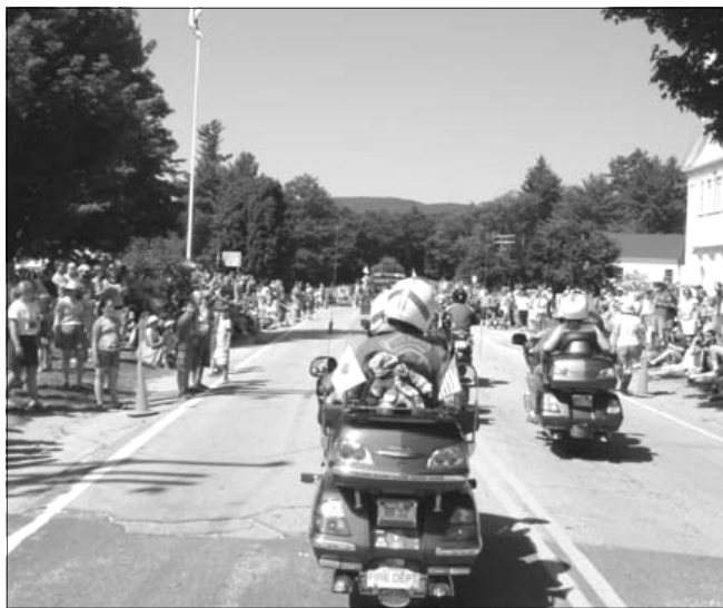
Bringing up the rear of the Hancock, NH Old Home Days parade with the crowds cheering and us waving. Hey, we'll do anything for a little attention!