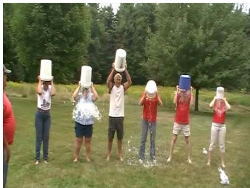
The Ice Bucket was thrown down at our Labor Day BBQ