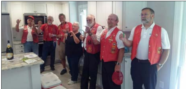
RKMC Founders with a champagne toast in the RKMC kitchen.

Past International President and current International President