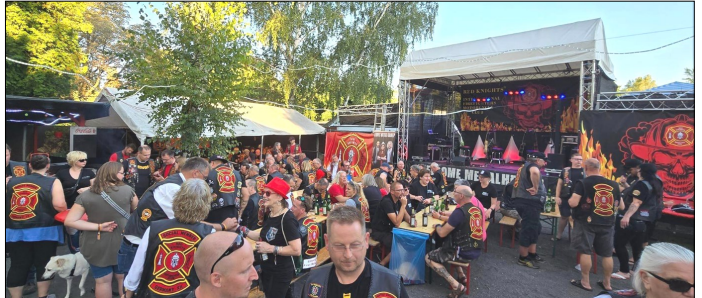
RK Convention BBQ