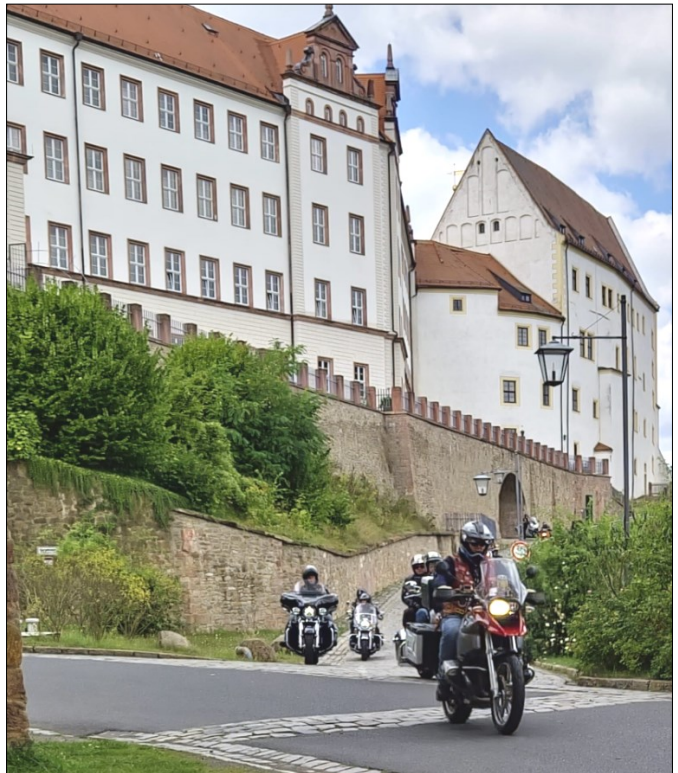
One of the guided rides around the region of the convention.