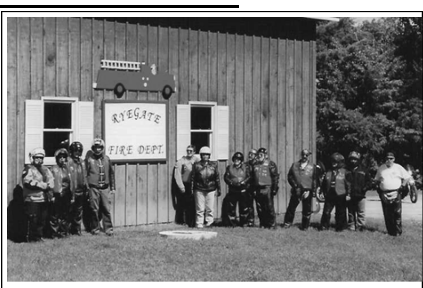
Red Knights – Vermont-Chapter-2 on one of their Grand Tour stops in Ryegate, VT this summer. Have you earned your Grand Tour Pin?

Photo albums will be kept displaying pictures of everyone who has completed the Grand Tour and will be available at all future conventions. So if you would like to see this program