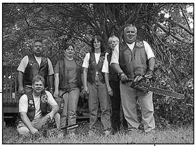
Some of the rides participating in the 2003 Maryland Firefighters' Memorial Ride