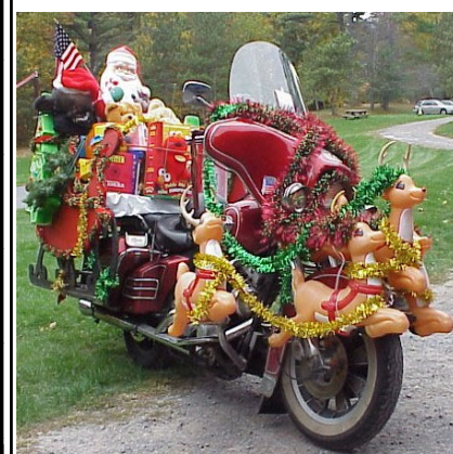
Santa's bike at the 2001 Red Knights (NY 12) Toy Run.