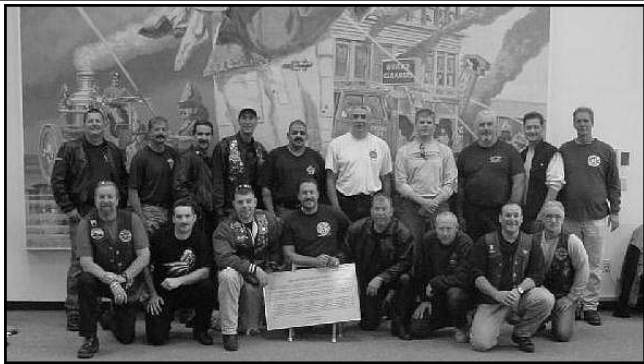
Members of Ohio-5 were hosts last fall to brothers from the New York City Fire Riders as they passed through Ohio on their way to

The issues discussed in these meetings are important to the club and every member has a right to participate in the discussions involving RKMC policy. The General Membership Meeting will be held on Saturday morning.