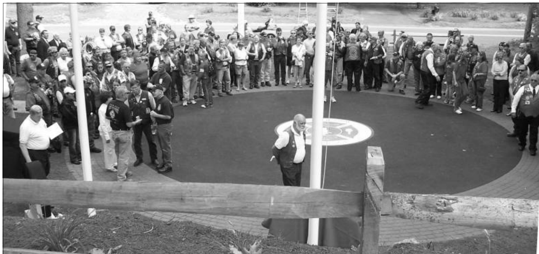
An impressive parade of Red Knights were escorted from downtown Worcester to Boylston for the dedication of the Red Knights Memorial on the grounds of the Boylston Fire Department — Back where it all began!