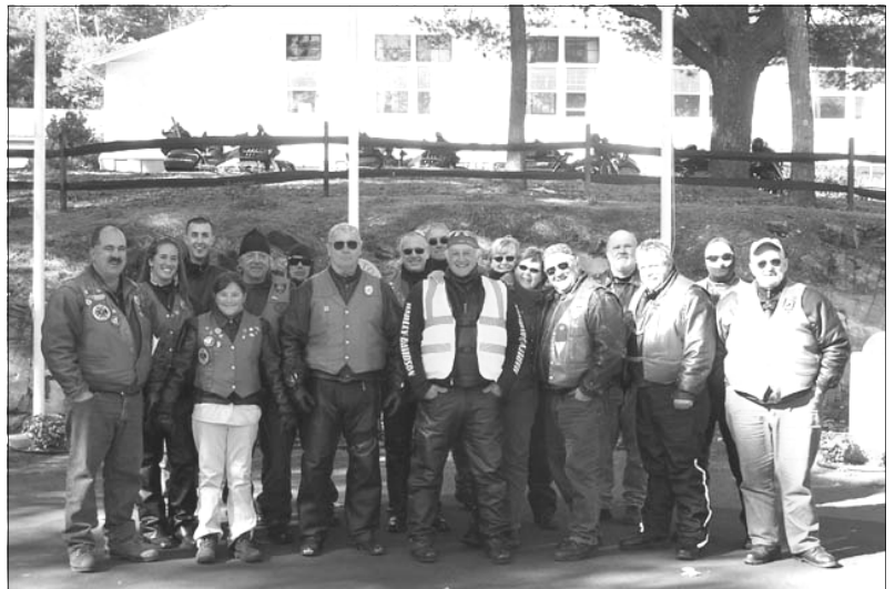
A stop at the Red Knights Memorial on our Polar Bear Ride in November.

It is always a great time looking at all the bikes, vendors, and wares at this show. Come join us on Saturday, February 7. We will meet at the Leominster train station about 9:00 a.m. for the ride into Boston and see if we can find our way — and always with a smile and a laugh!