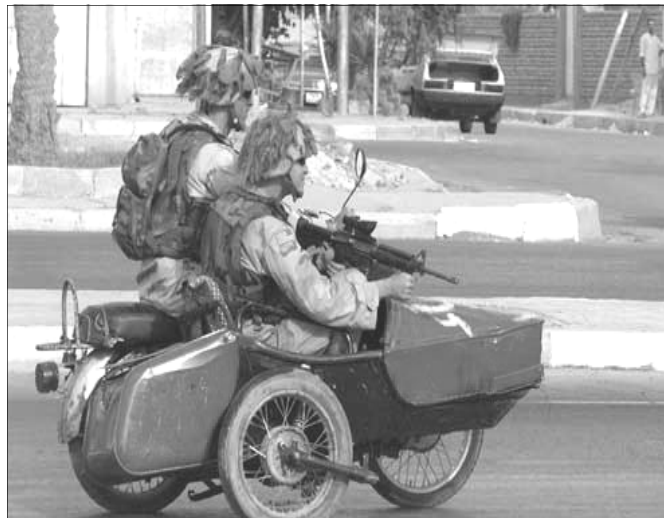
Road Captain training program ??!

January 17, February 21, March 21, and April 18