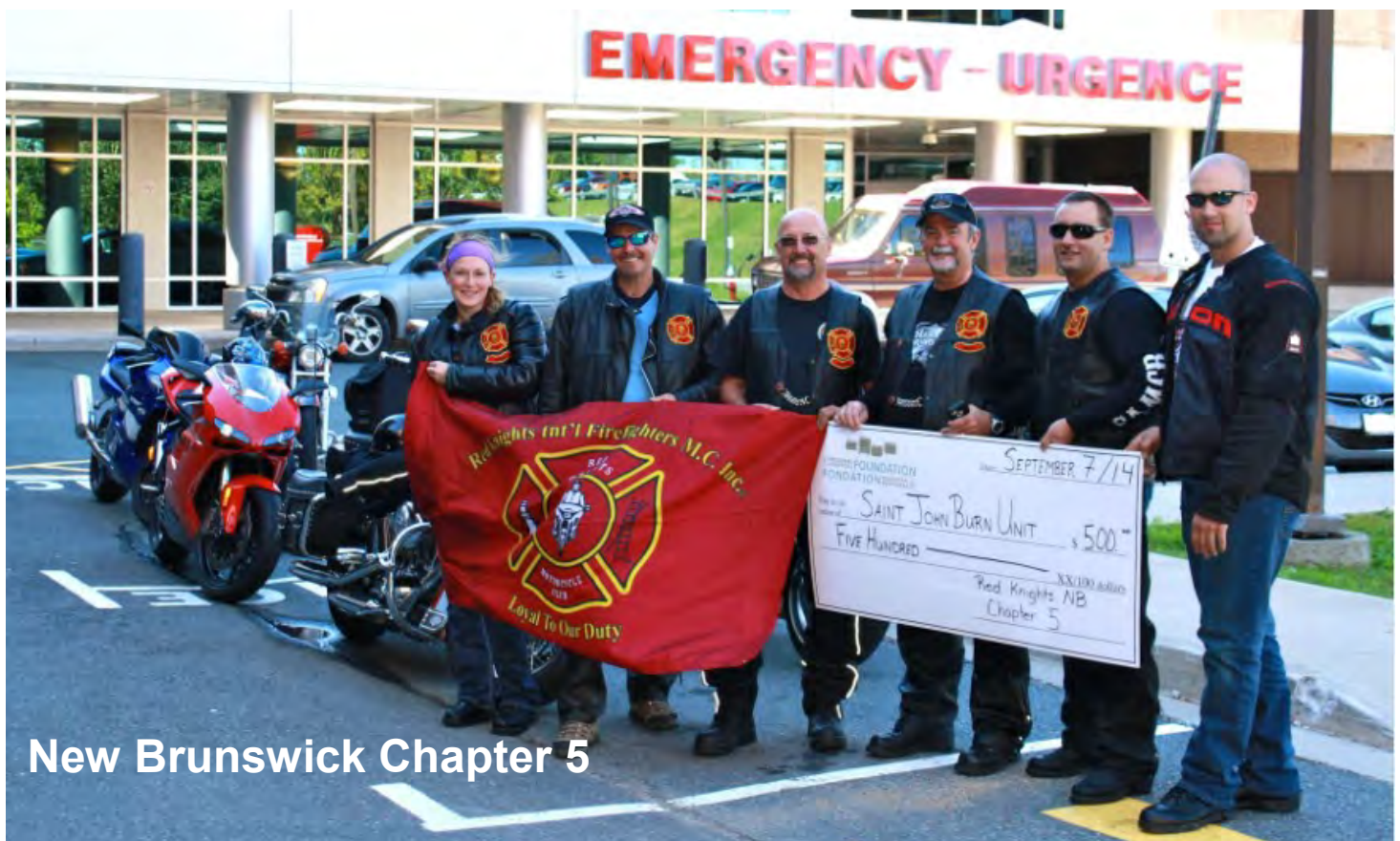
New Brunswick Chapter 5