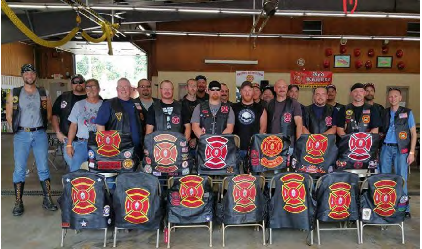
First annual West Virginia state picnic