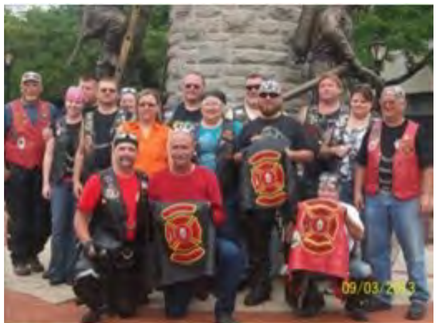
Illinois Chapter 1 and 2 at the Ride to Remember 2013