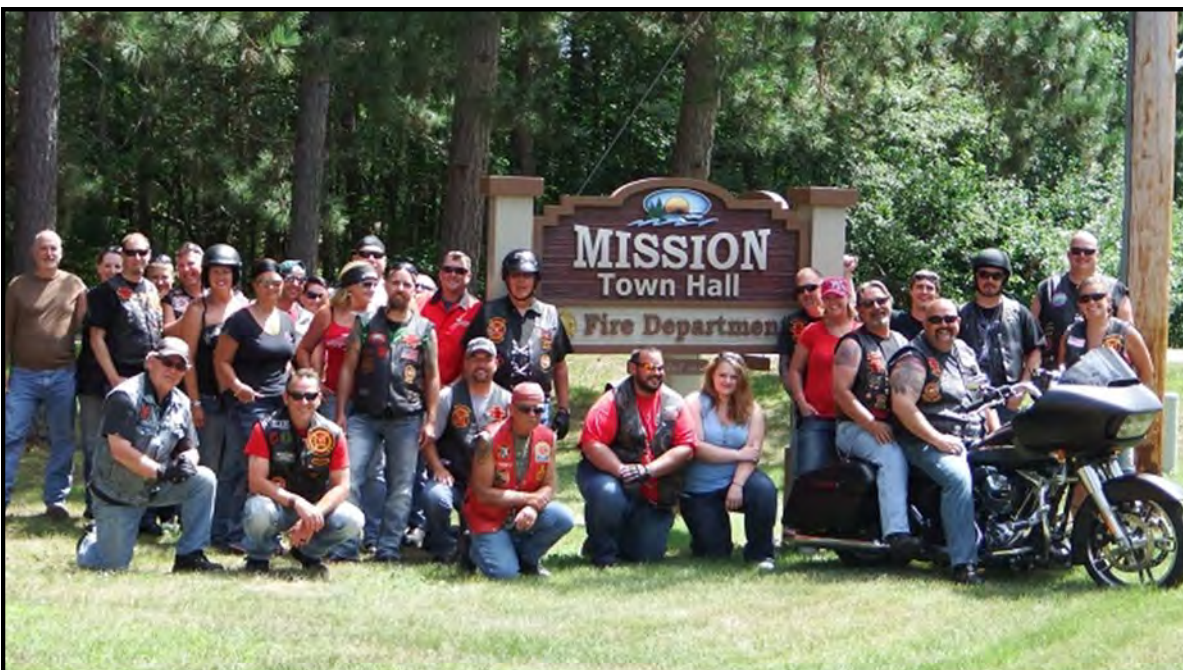
MN 4 & 7 and MB 1 on a 12 Stations Tour