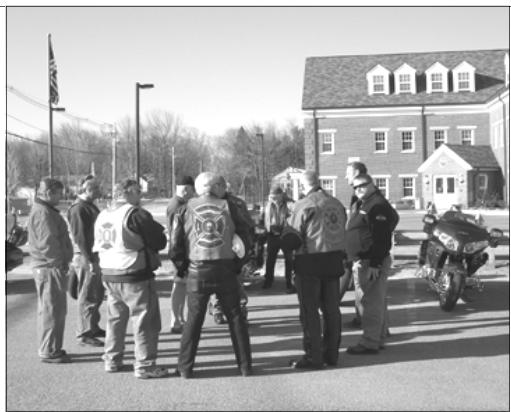
Our first ride briefing of 2008!

If you applied for the scholarship but did not win one this year, please consider applying again in the future.