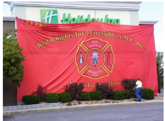
Holiday Inn of Rutland Adorned in Red!