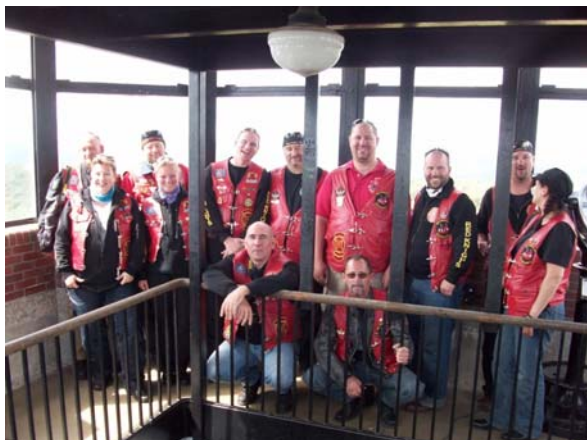
Our European guests in the tower in the Quabbin Park — and an international group of Red Knights pose outside the New Salem FD after the BBQ.