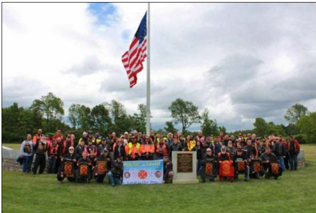
The Red Knight 2016 Cannonball Ride at Americade with a stop at the Saratoga battlefield.