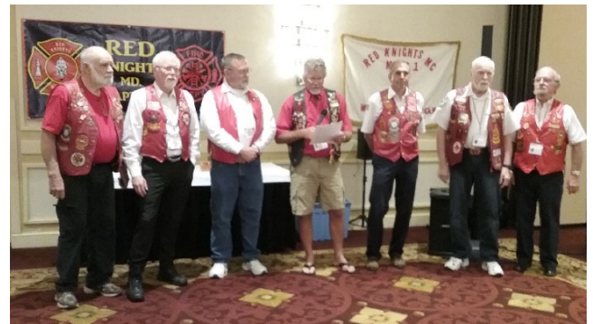
The founding fathers of the RKMC present at the 2019 Yankee Rally in Marlborough