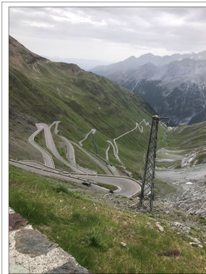
Stelvio Pass in Switzerland and Italy

many more years of riding and meeting new people and catching up with old friends. We are so blessed to be Red Knights and realize how special each and every one of you are.