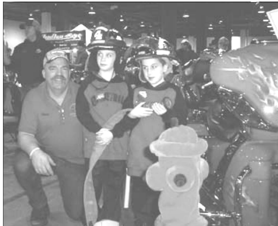
A flyer about the RKMC Texas Convention is also included in the mailing in case anyone wants to head off to Texas in May!

Our Chapter has tickets to sell. Contact treasurer Tim Kilhart to buy your winning ticket. Please support this fund raising activity as it is raising funds for the RKMC Memorial.