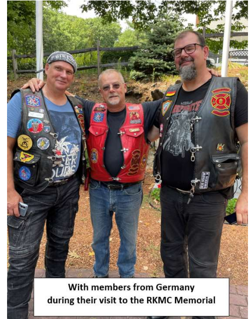
With members from Germany during their visit to the RKMCM Memorial