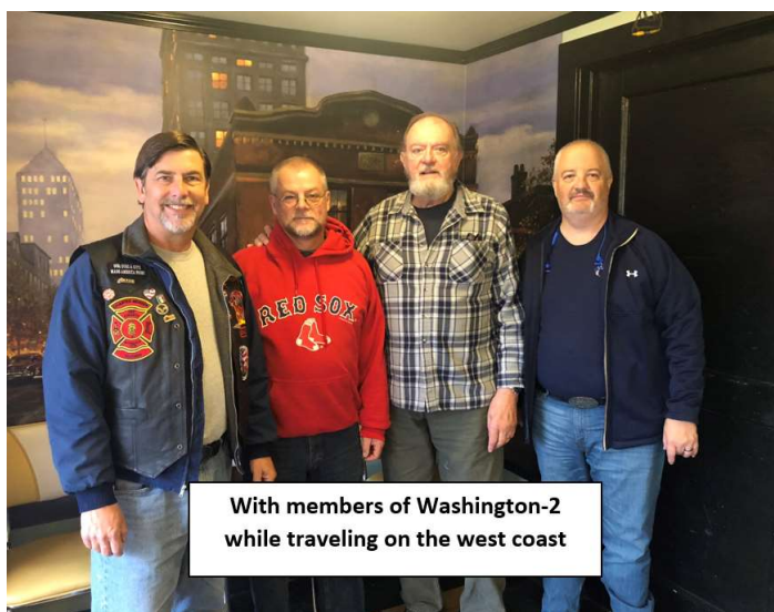
With members of Washington-2 while traveling on the west coast

Relationships, like these, give us better understanding of each other and helps us grow together more as friends in this great organization. For many of the last fifteen years, I and one or two of my chapter riding buddies have made it a point to head out for a motorcycle vacation during the riding season. Sometimes with our spouses along and sometimes a guy's ride. One point we always make once our trip planning begins to take form on paper is, "what Red Knights will we be near?" Those brief encounters, whether for a coffee, a meal, or a few miles riding together is always a great opportunity to expand our friend list.